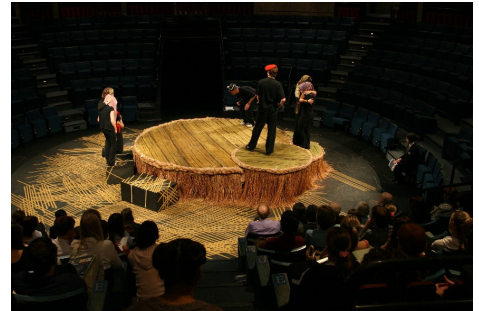
Firing the Imagination