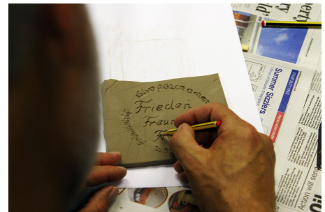
Creating Tiles at Firing the Imagination