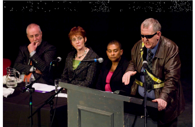
A discussion on hate crime

We are also happy to discuss how you can how you can commemorate Holocaust Memorial Day in your community. You can call any member of our team on 0845 838 1883 or email enquiries@hmd.org.uk .