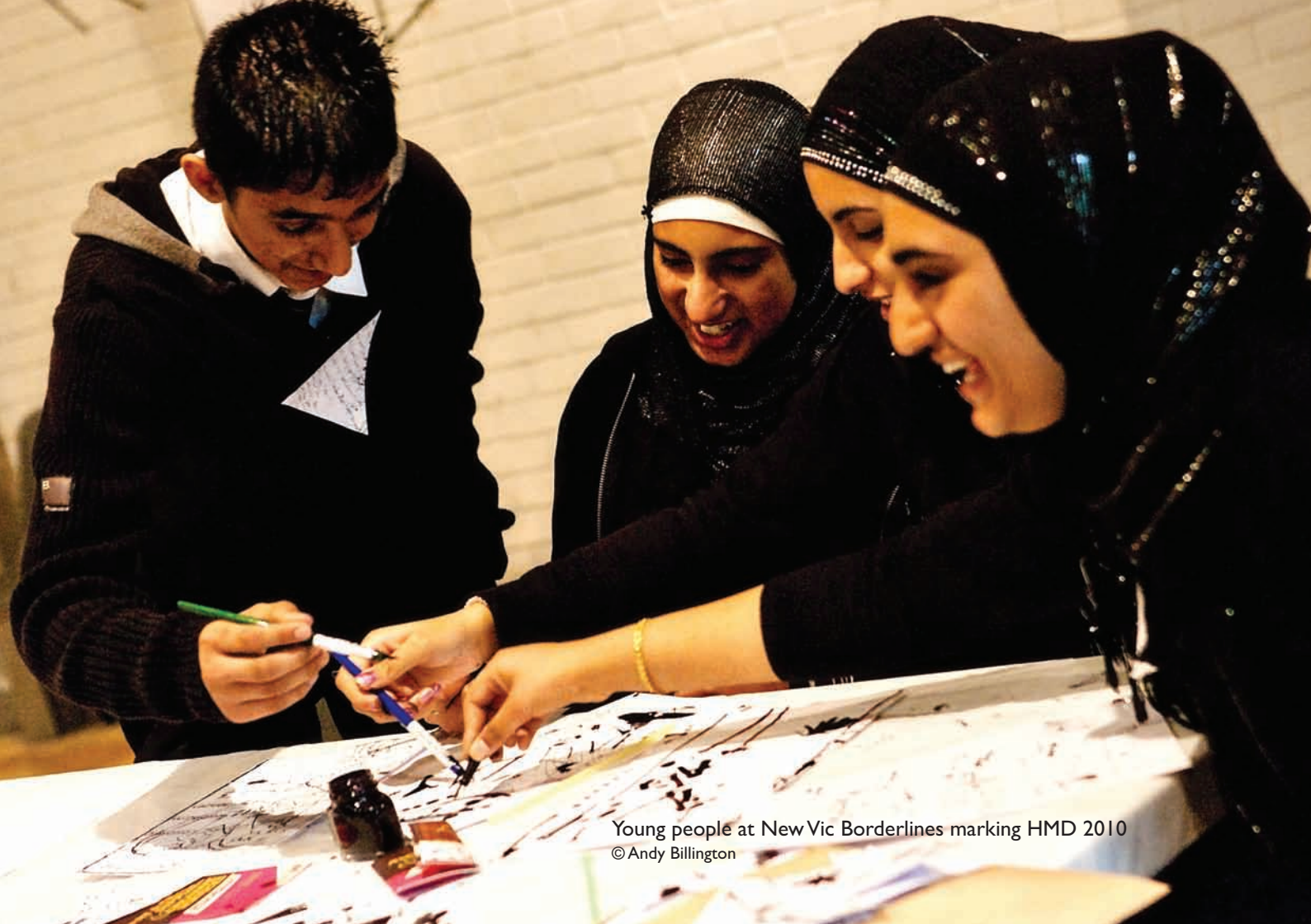
Young people at New Vic Borderlines marking HMD 2010