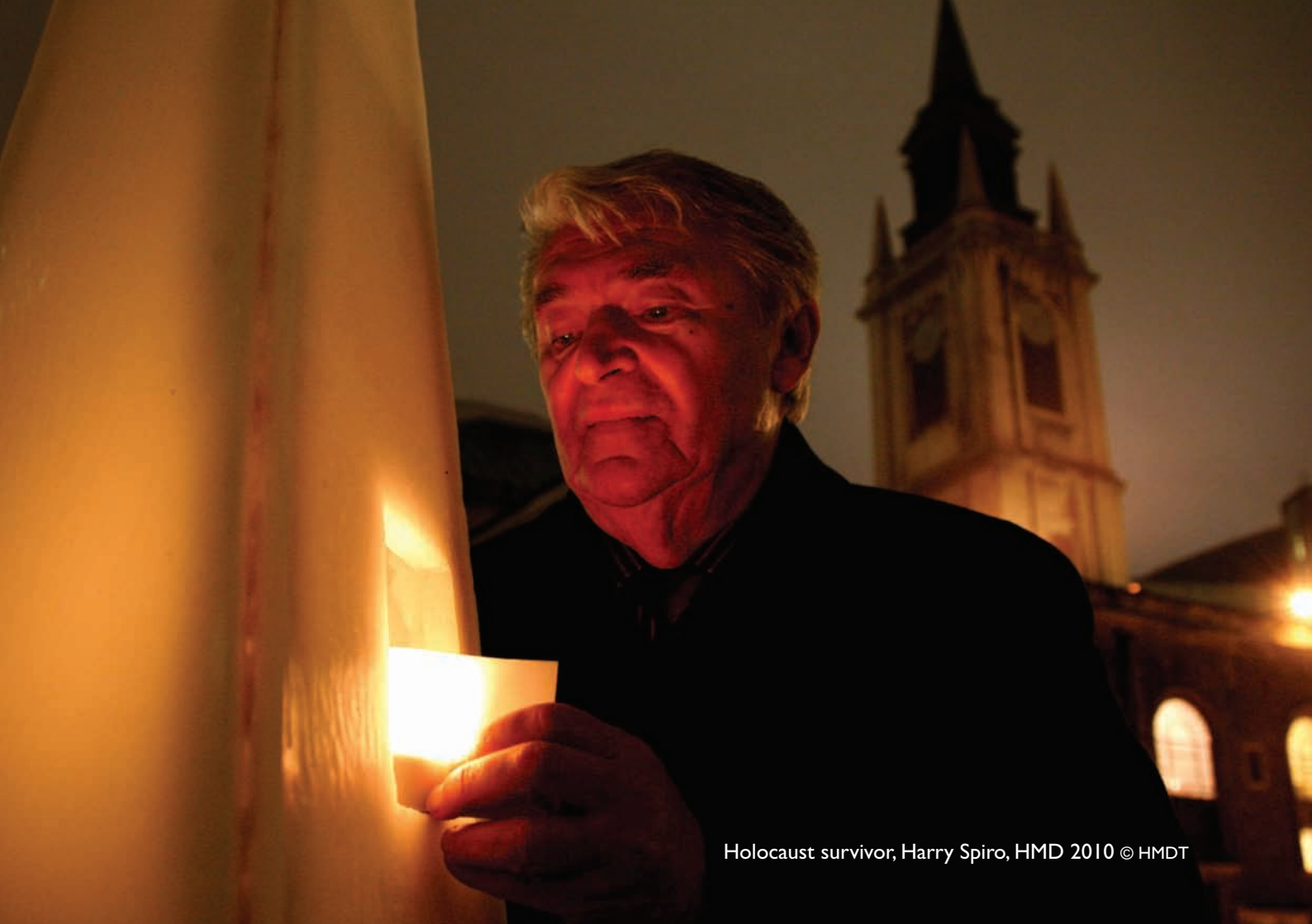
Holocaust survivor, Harry Spiro, HMD 2010