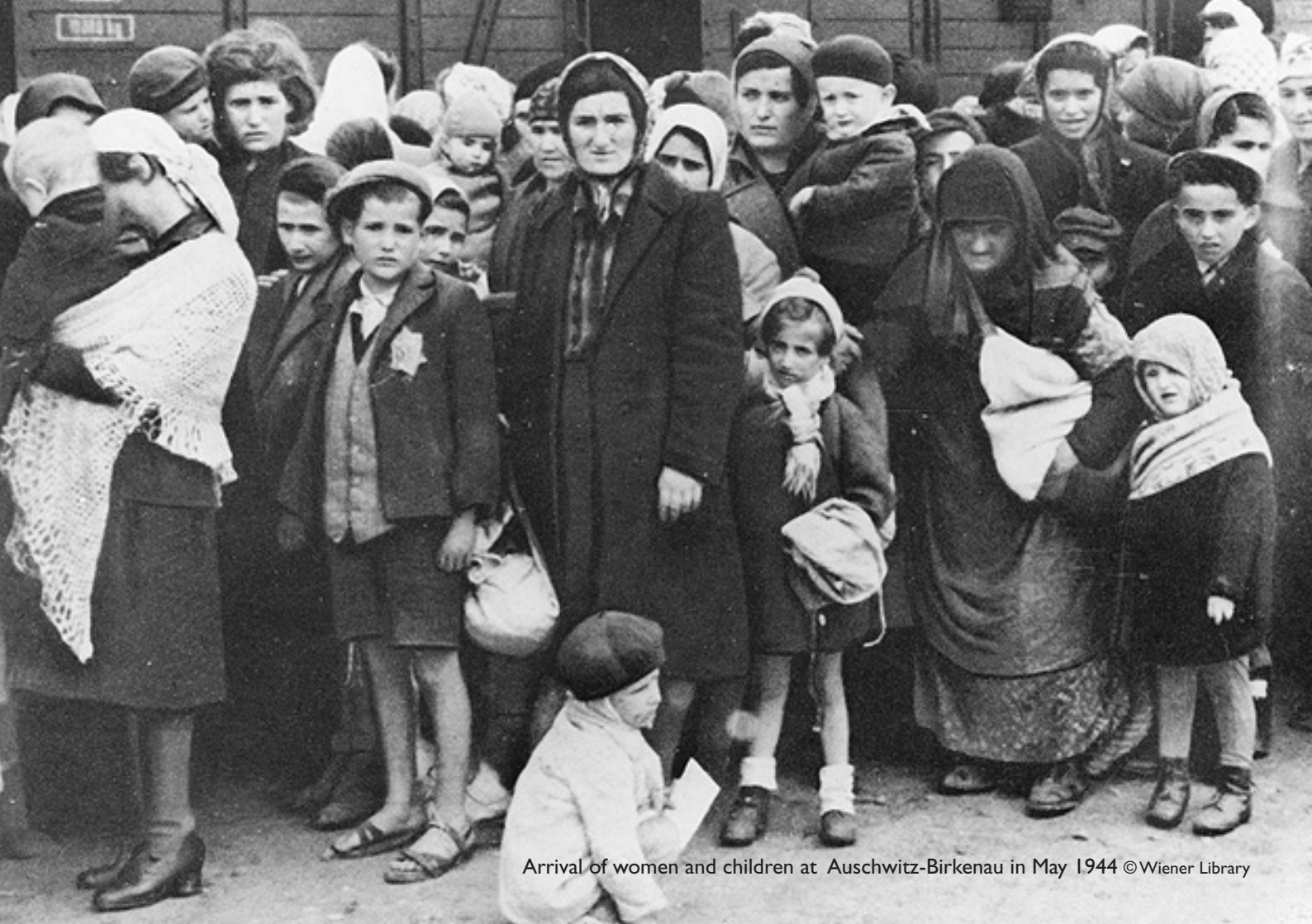
Arrival of women and children at Auschwitz-Birkenau in May 1944