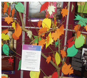
Dorchester Library displays messages from their library members for HMD06